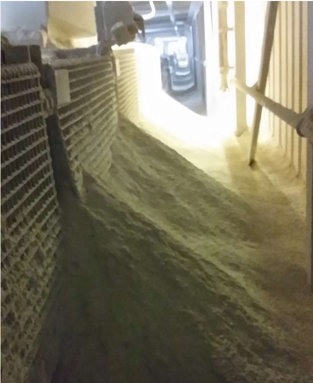
Dust blocked walkways and posed a potential safety risk.