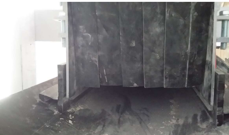
Dust curtains are set throughout the chute to slow air flow and reduce fugitive particle emissions.

mounted on the top of the loading chute, but the filters clogged so quickly, maintenance became burdensome.”