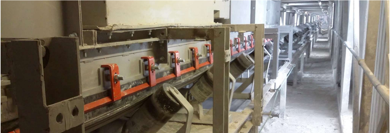
ApronSeal Skirting contains small lumps and fines.

system forms a tight belt seal, delivering outstanding fugitive material control.