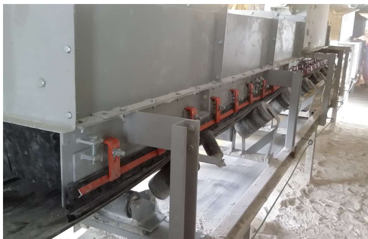
The EVO External Wear Liner helps prevent damage to the chute wall.

The new design raised the chute 102 mm (4 in.) from its previous position to accommodate the EVO External Wear Liner. Mounting brackets with jackscrews provide a secure mount, with precision adjustment of the wear liner to reduce spillage. The system closes the gap between the liner and the sealer, thus eliminating abrasion from trapped material without interfering with existing supports. When accompanied by the Double Sided ApronSeal skirting and clamps, the