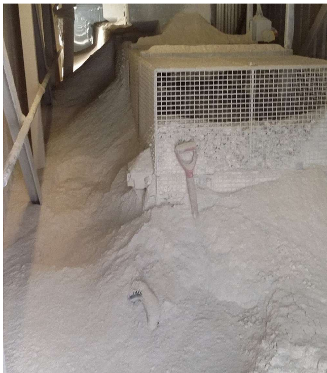
Piled high enough to encapsulate the tail pulley and belt, the dust was a serious problem.